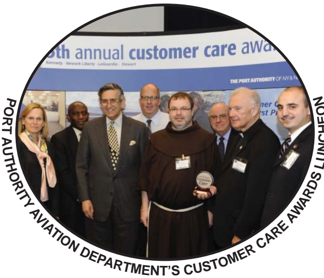
PORT AUTHORITY AVIATION DEPARTMENT'S CUSTOMER CARE AWARDS LUNCHEON