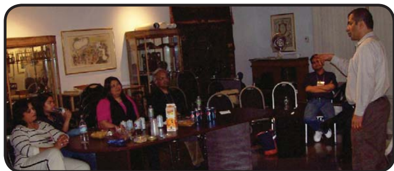
Project Interchange: SECOND GENERATION INDIANS