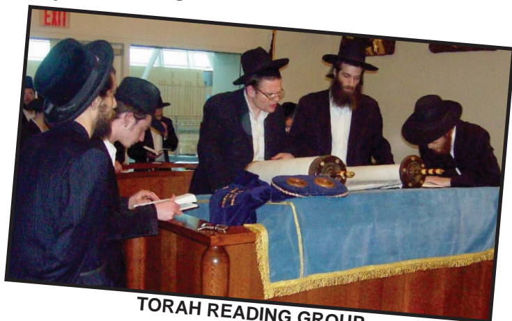
TORAH READING GROUP