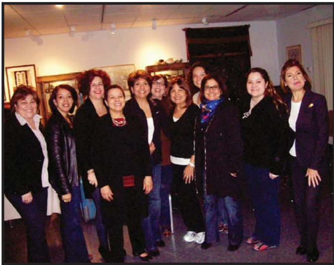
Project Interchange: LATINO BUSINESS WOMEN